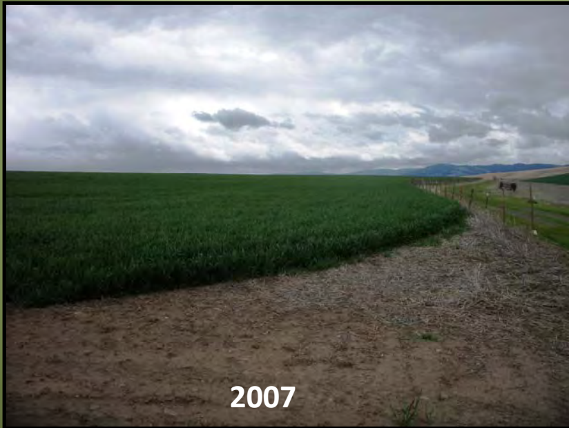
Photo Point Monitoring