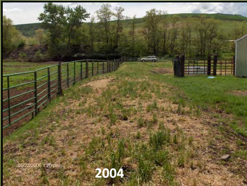
Photo Point Monitoring