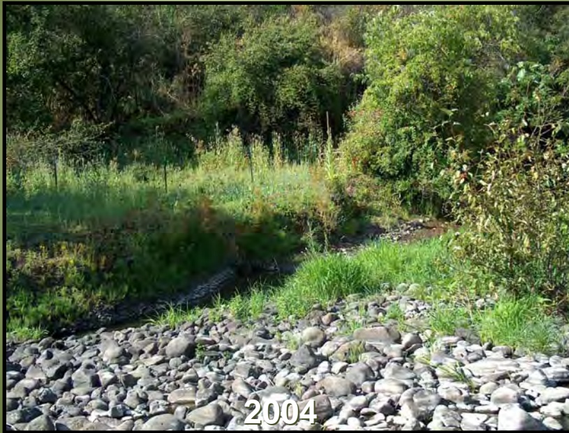
Photo Point Monitoring