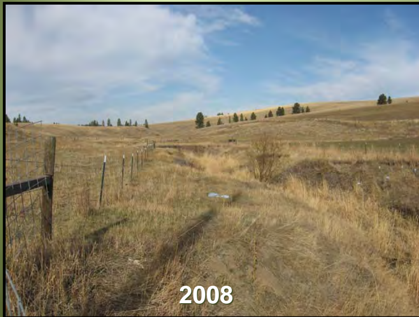
Photo Point Monitoring