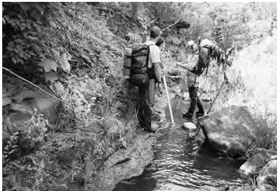
Field crews of three like this one shown above gather stream inventory in local watersheds.

Aside from stream inventory, summer field crew will also treat Knotweed and Orange hawkweed. The noxious weeds will be treated at predetermined sites using techniques the