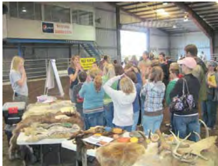
The wildlife station