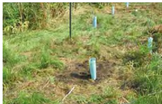
Tree planting site in Cottonwood Creek watershed