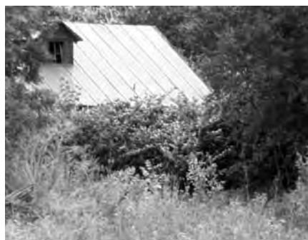
Knotweed can grow upwards of 10 feet tall, taking over habitat as shown at this site that District staff will treat this summer.

District has implemented in the past. Knotweed will be treated by chemical injection at the stem and hawkweed sprayed. Kill rate will be closely monitored following the weeks of treatment and at which point crews may re-visit the site if more treatment should be needed.