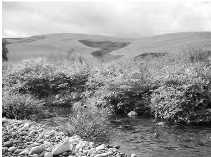
Knotweed can be seen on several portions of Lapwai Creek like this one shown above