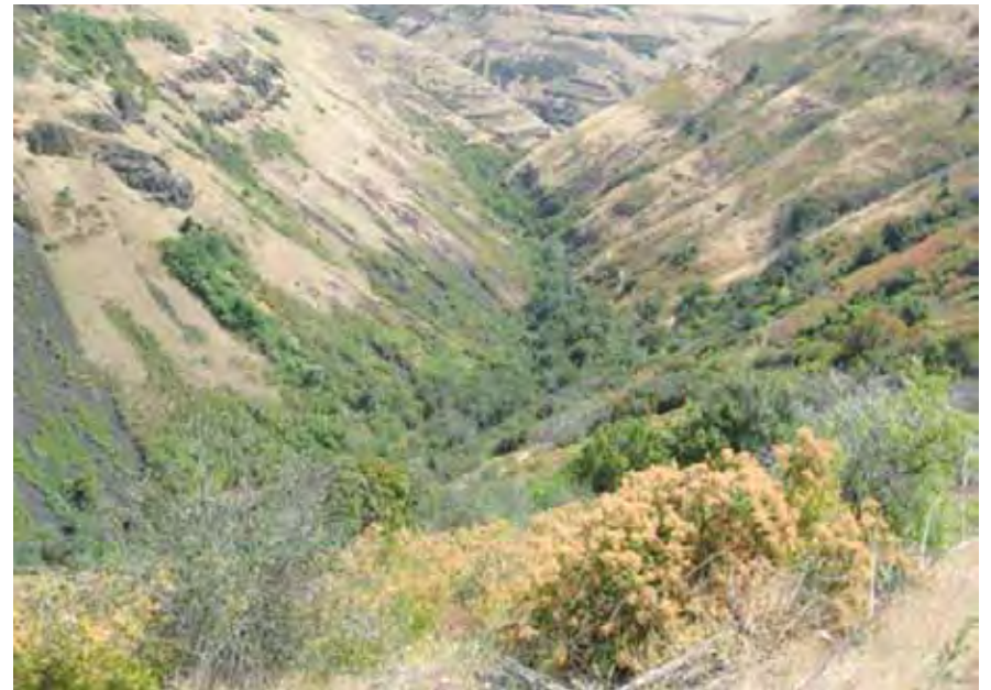
Catholic Creek watershed overview

Landowners are encouraged to contact Brenda Boyer at (208) 843-2931 for questions/comments.